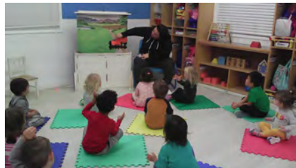
Group Daycare children in their circle time.