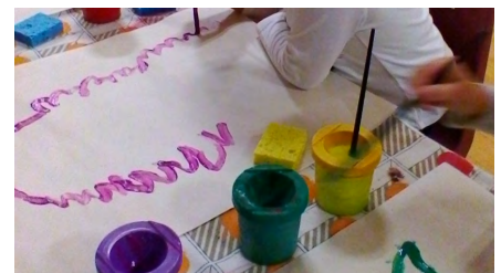
Meadowbrook children painting a tree.

FOR ANY ENQUIRIES, PLEASE DO NOT HESITATE TO REACH OUT BY EMAIL OR PHONE.