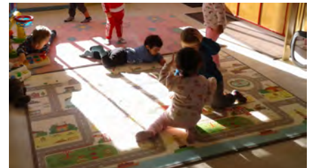
IT children exploring light and shadow.