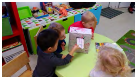
IT children mailing their letters to Santa.