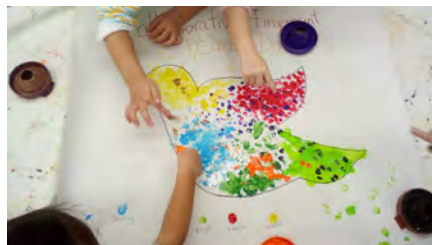
Preschoolers doing a Peace Dove Activity at Parkland Players.