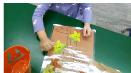
Preschool child doing a sorting fall leaves activity.

FOR ANY ENQUIRIES, PLEASE DO NOT HESITATE TO REACH OUT BY EMAIL OR PHONE.