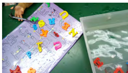
Alphabet recognition fishing game at our centre.