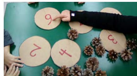
Learning numbers through sorting pinecones.