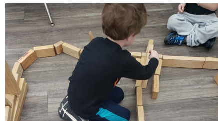
Kids were very proud of their construction