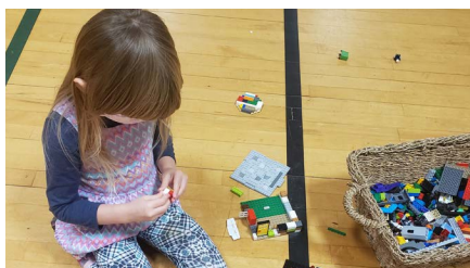
Lego fun in Out of School Care