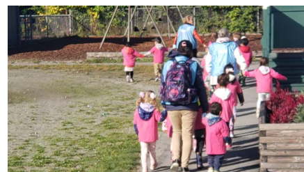
Out for our afternoon walk

FOR ANY ENQUIRIES, PLEASE DO NOT HESITATE TO REACH OUT BY EMAIL OR PHONE.