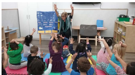
Our preschool class during circle time