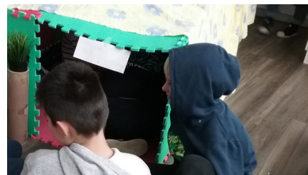
Out of School kids making a fort!