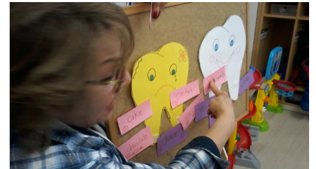
Learning about health and self-care.