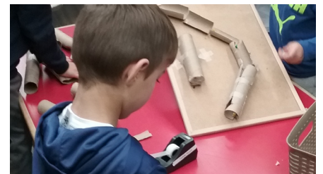
Kids using recycled material to build a marble track.

FOR ANY ENQUIRIES, PLEASE DO NOT HESITATE TO REACH OUT BY EMAIL OR PHONE.