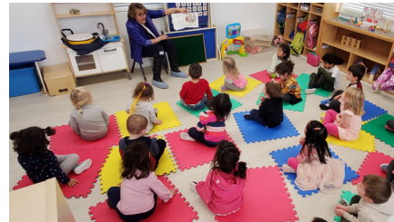
Our Group Daycare class during circle time.