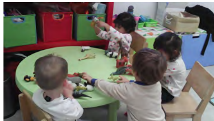
Infant and Toddler children playing with dinosaurs and animals toys.