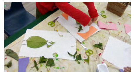
Out of School Children doing a collage using natural materials.

FOR ANY ENQUIRIES, PLEASE DO NOT HESITATE TO REACH OUT BY EMAIL OR PHONE.