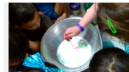
Meadowbrook children exploring a science experiment.

FOR ANY ENQUIRIES, PLEASE DO NOT HESITATE TO REACH OUT BY EMAIL OR PHONE.