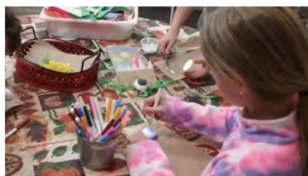
Out of School Care children making recycle collage.