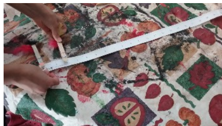
Children in Out of School Care playing a Turkey Race Activity.