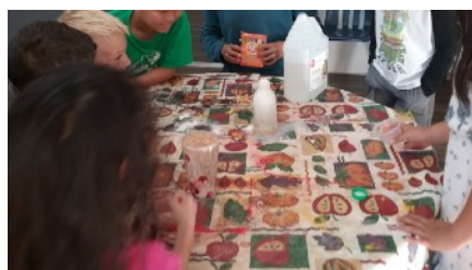
Children in Out of School Care exploring science experiment.