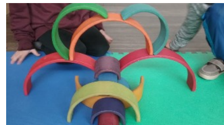
Children in OSC made a unique creation with colourful blocks.